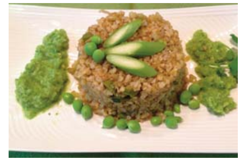
Freekeh Risotto with Fresh Snap Pea-Asparagus Puree

my brother who lives on the island of that I knew it would be the next food ventured down to a delightful little jewel of a town in Provence called L'Isle sur-la-Sorgue. The town truly is situated on an island in the middle of the river, and we stayed at an inn, La Prevote, which also spans a small portion of the river, with a little waterway right under the bar! It was formerly a convent, and therefore situated directly adjacent to the Catholic church.